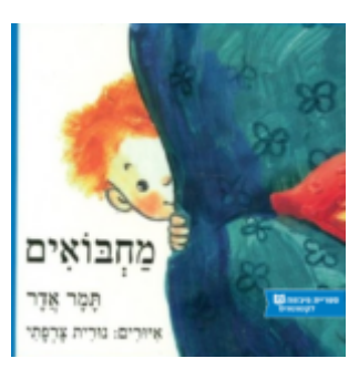
By: Tamar Adar illustrations: Nurit Zarfati הוֹצְאָה: יסוד